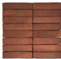
EW0465 Rød nuanceret LESS

The illustrated products below are examples of products covered by this EPD.