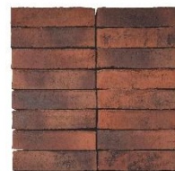
EW0466 Kobber LESS