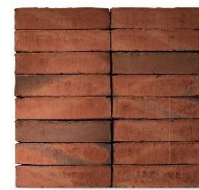
EW0409 Valmue LESS