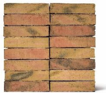
EW0494 Efterår m/kul LESS

The illustrated product below is an example of a product covered by this EPD.